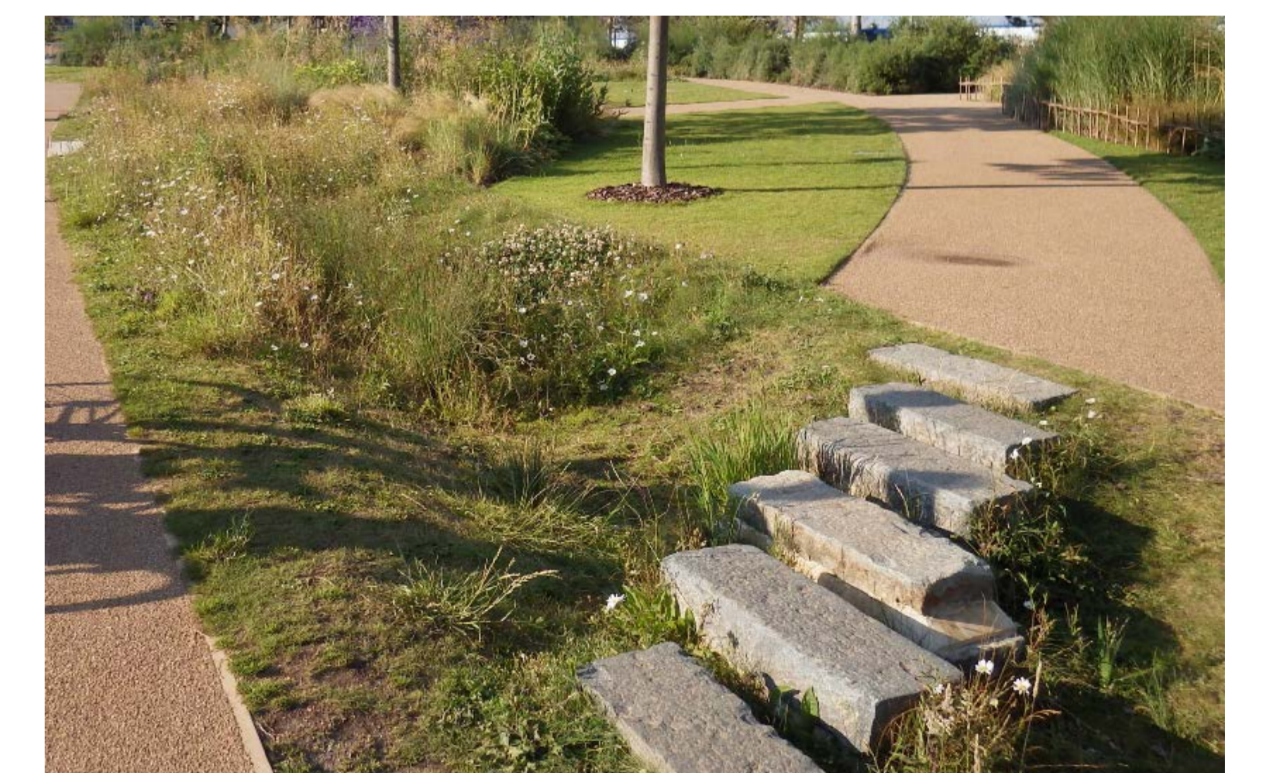
Olympic Park swale