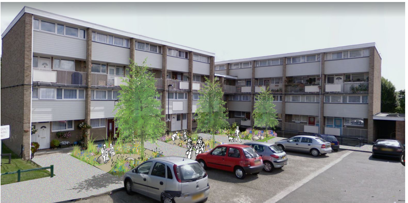
Figure 1: Visualisation of possible Four Hills improvements