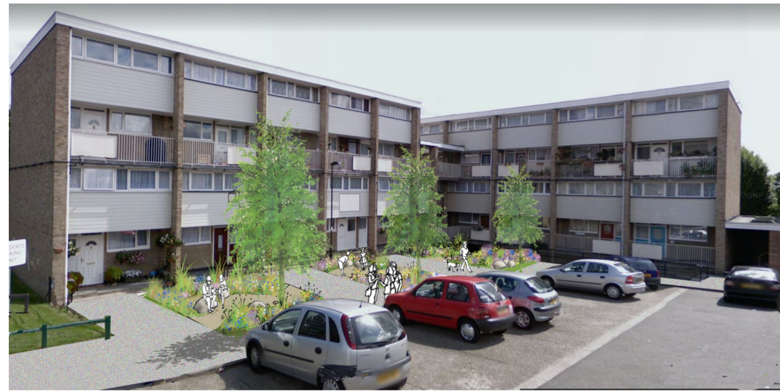
Rain gardens on Blossom Hill