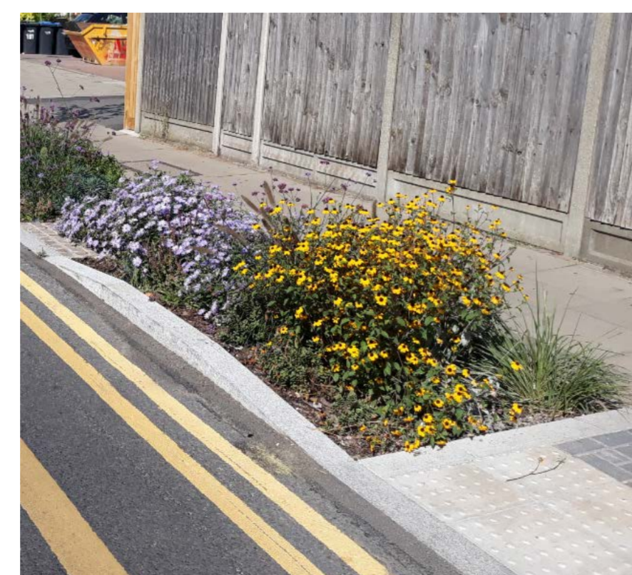
Rain gardens delivered by Enfield Council