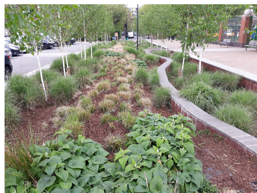
Award winning Australia Road scheme