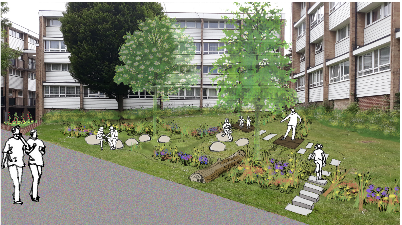
Figure 2: Visualisation of possible Four Hills improvements