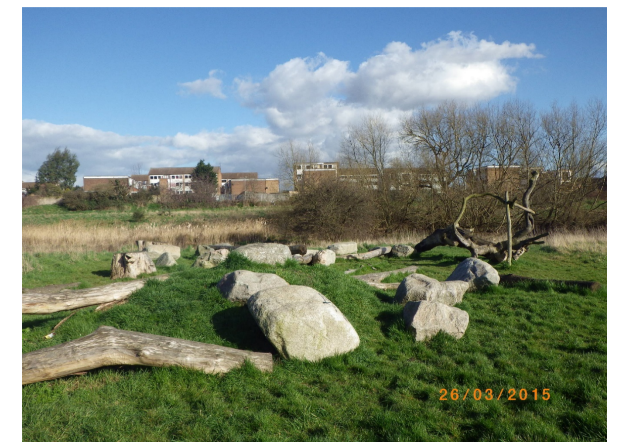
Informal seating area